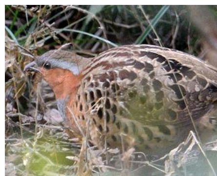
Chinese Bamboo Partridge

Built in 1960, Fuzhou National Forest Park covers 860 hectares and is rated as one of the top ten forest parks in China. This extensive natural area features more than 2,500 kinds of rare and precious trees from 36 countries that have been introduced and planted inside the park. Inside the park, there are many gardens for certain groups of precious trees species.